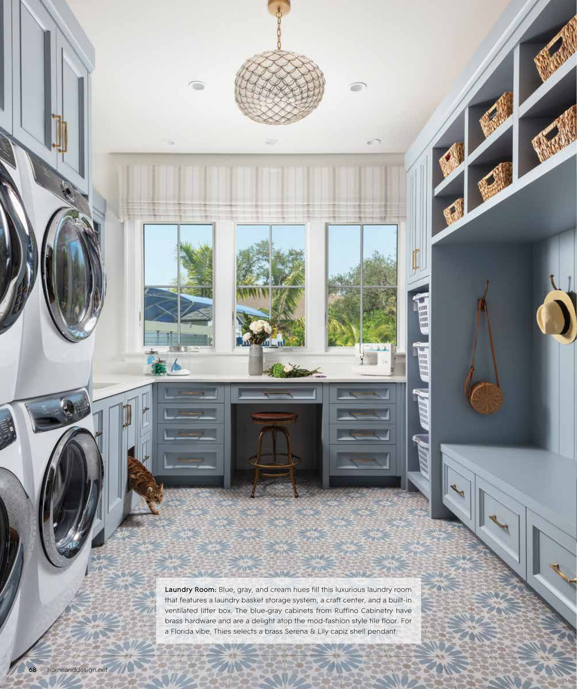
Laundry Room: Blue, gray, and cream hues fill this luxurious laundry room that features a laundry basket storage system, a craft center, and a built-in ventilated litter box. The blue-gray cabinets from Ruffino Cabinetry have brass hardware and are a delight atop the mod-fashion style tile floor. For a Florida vibe, Thies selects a brass Serena & Lily capiz shell pendant.

This home wouldn't be a destination without its vacation-style backyard. Huge fans of Congdon's reality television series "Insane Pools Off The Deep End," the homeowners knew Congdon would be the perfect choice to design their oasis hideaway. Growing up in Vermont and working off the land gave Congdon an appreciation for mountains, rivers, rock formations, and streams that inspire these imaginative, interactive outdoor designs.